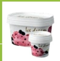
CartoCan ® conic