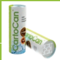
CartoCan ® liquid